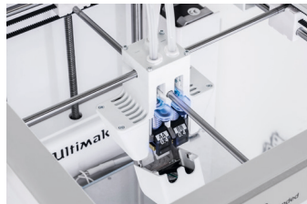
Print Cores installed.