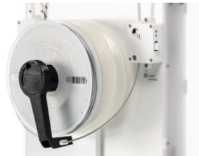
Print guide and materials loaded.