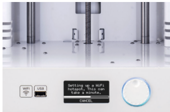
Connected to internet.

To connect to WiFi please have a computer or smartphone near your printer during set-up. To connect to ethernet please use the ethernet cable to connect your printer to your router.